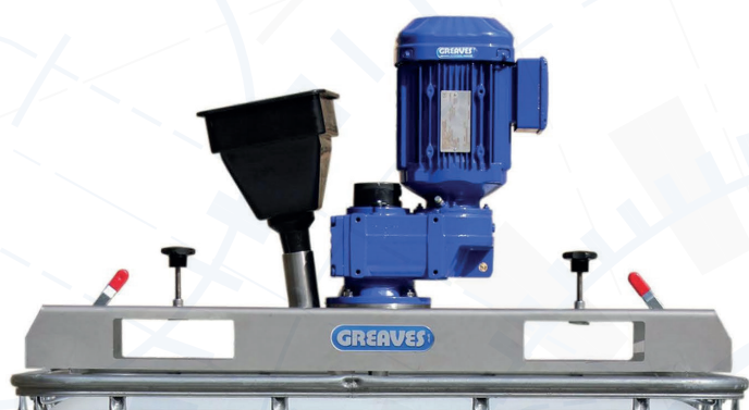
IBC 2200 F45 - With Chute & FLT clamps

Heavy Duty stainless steel bridge, which mounts directly on to the IBC frame and is secured in place with a quick release toggle clamp and has fork truck handling inserts.