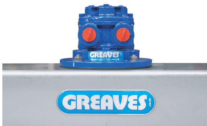
IBCA - Pneumatic Direct Drive