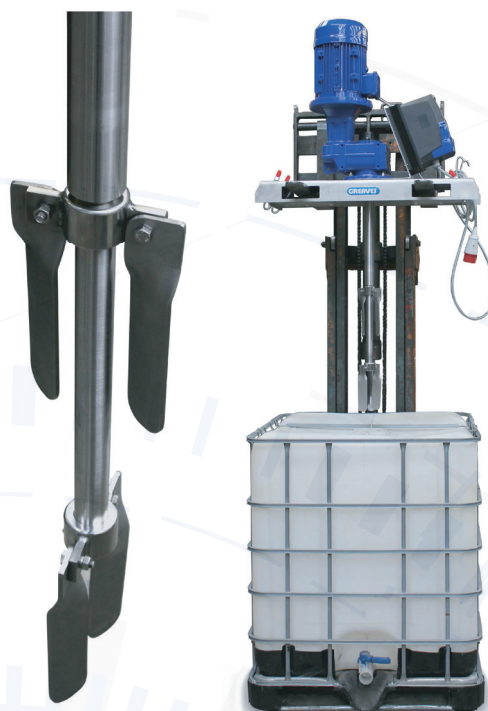
HD IBC 7500 F50T