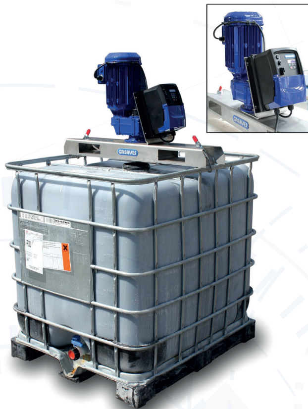
V.IBC 3000 F45T

We can supply custom design agitators for all applications including transportable mixer drives with permanently installed mixer shafts and independent bearing housings.